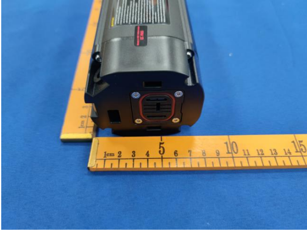
样品图片 (Sample photograph) -6