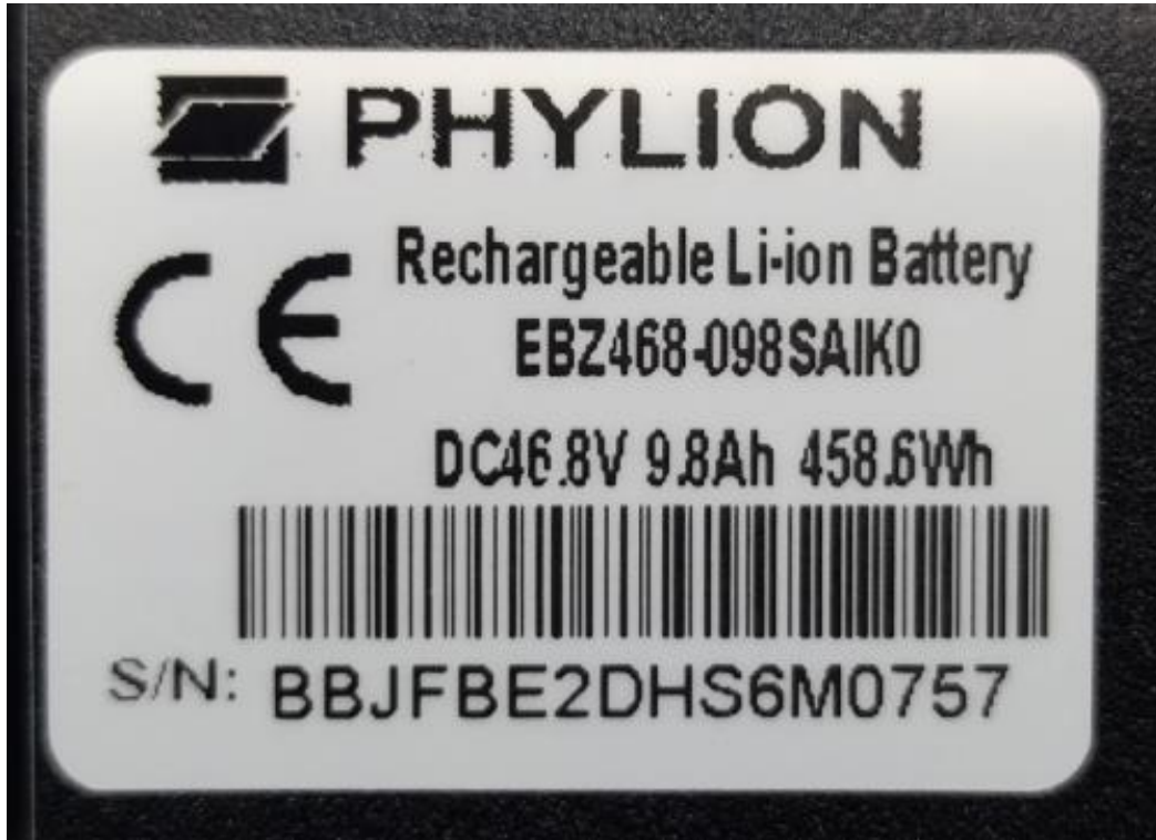
样品图片 (Sample photograph) -8